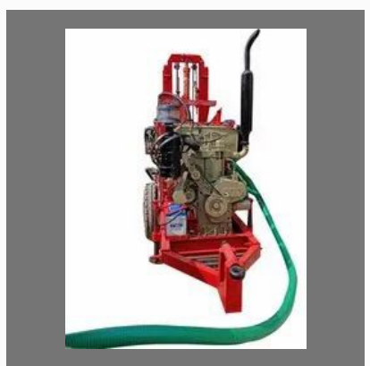
Mini Hydraulic Borewell 26hp Double Cylinder