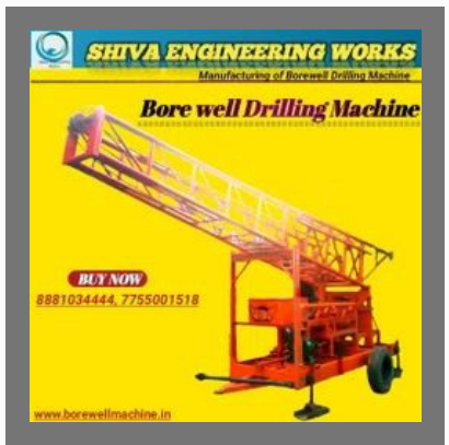
Tractor Operated Water Boring Machine